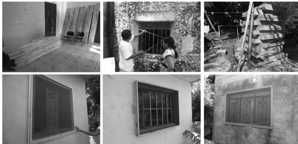
Figure 3. Manufacture and installation of insect screens for vector control. All screens were manufactured locally in the communities, using a high-quality fiber mesh with a wooden frame fitted to each bedroom window.

local situations and bypass obstacles. For example, community participation was limited in Sudzal following political tensions during local elections, as the project was perceived to be too strongly linked to the local government. Therefore we had to relocate community meetings in schools and the local health center to emphasize the non-political nature of the vector control intervention. Local governments were very supportive of the interventions, which they have readily incorporated as part of their social programs for housing improvement. For example, in Teya the mayor has agreed to fund the installation of extra window screens to large families who have additional bedrooms not covered by the project. Similarly, in Sudzal the mayor has agreed to provide