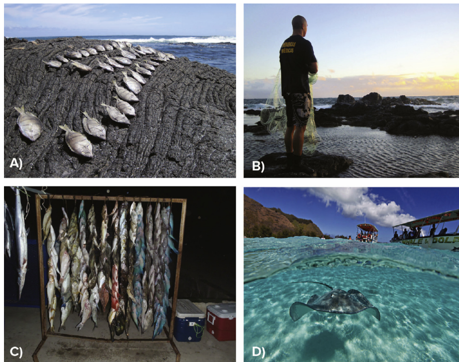
Fig. 2. A) Convict tangs ( Acanthurus triostegus ; Hawaiian name: manini) drying on lava rock on Hawaii Island, Hawaii ; B) Hawaiian fisherman with net ; C) Variety of reef fish species caught in Moorea ; D) Tourism in the no-take reserve in Moorea.

In order to manage recreational and fishing uses of the Moorea lagoon resources, a management plan, called PGEM ("Plan de Gestion de l'Espace Maritime"), was established in 2004, after 10 years of consultation with all users of the lagoon. The PGEM regulates the entire Moorea lagoon and the Moorea outer slope (down to 70 m depth). The management plan is a marine spatial planning tool that