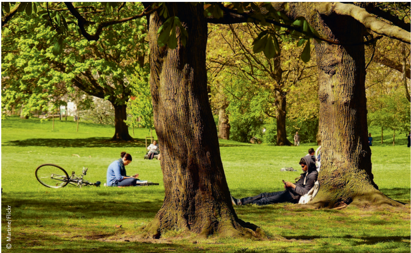
FIGURE 2: Nature-based solution approaches can promote the development and management of urban ecosystems to offer sustainable and cost-effective solutions to societal challenges like global warming, water regulation and human health, while enhancing biodiversity. Here, the Green Park in London.