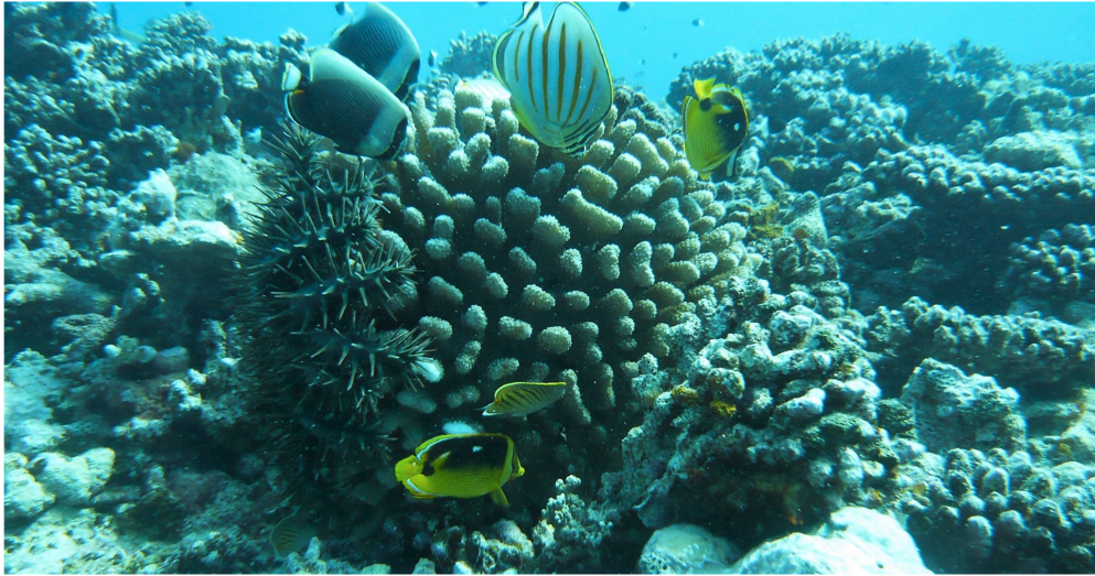
Figure 2. Aggregation of a diversified guild of 10 macro-predators simultaneously feeding upon a guarded coral. This aggregation was observed following widespread coral decline (note the absence of live coral in the background) in August 2008 at 12 m depth on Tiahura reef in Moorea, French Polynesia. The predator guild was composed of a crown-of-thorns seastar (COTS) and nine butterflyfishes from species Chaetodon ornatissimus , C. pelewensis , C. quadrimaculatus , C. reticulatus . White feeding scars characteristic of recent COTS predation can be seen on the guarded coral ( Pocillopora eydouxi ).

had dropped to the much lower average value of 4.3 \pm 0.9 SE fish.200m -2 (surveyed in June 2008, equivalent to 0.02 fish.m -2 ). The observed aggregation thus represented a more than 400-times concentration of the predation pressure exerted by the butterflyfishes, and was targeting a guarded pocilloporid that was already under attack by COTS (Figure 2, Supplementary Image 1).