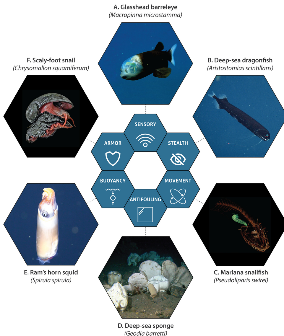
Fig. 3. Inspiration from deep-sea species. Life in the deep sea is specially adapted to thrive in areas characterized by high pressure, absence of sunlight, and limited nutrients. Examples include (A) the mirrored eyes of mesopelagic teleost fish like the glasshead barreleye fish; (B) the transparent teeth of the deep-sea dragonfish; (C) the morphology of the Mariana snailfish (note the CT scan revealing a small crustacean, the green shape, in the snailfish's stomach); (D) antifouling compounds extracted from deep-sea sponges; (E) the air-filled shell that provides buoyancy to the Ram's horn squid; and (F) the armored shell of the Scaly-foot snail.