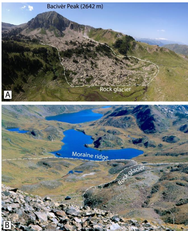
Figure 38.2. Rock glacier development at the time of the Bølling-Allerød Interstadial (14.6–12.9 ka).

In the eastern massifs of the Pyrenees such as the southern flanks of the Tossa Plana and Campcardós, and likewise the SE Carlit, exposure ages from ice-marginal deposits have shown that the landscape had been entirely deglaciated at the beginning of the B-A, thereby promoting the onset of paraglacial rock slope failures and a proliferation of rock glaciers and, more locally, small debris-covered glaciers (Fig. 38.2).