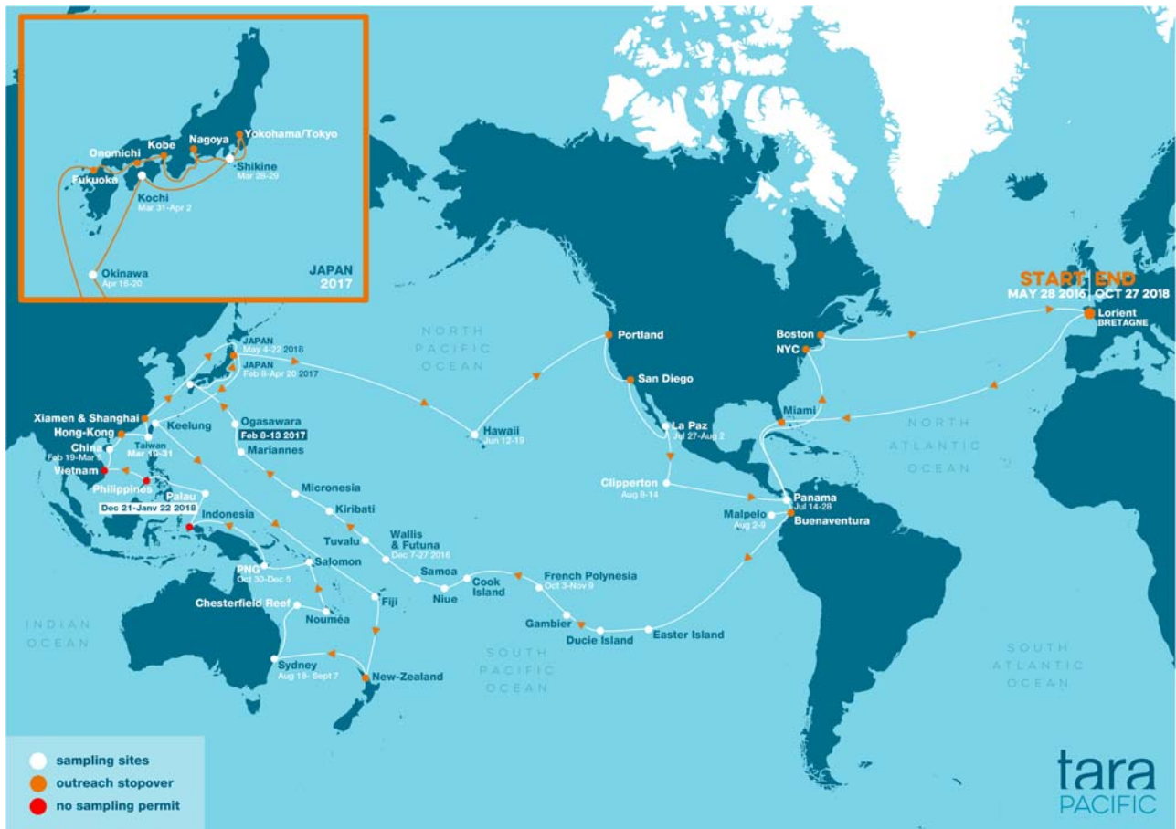
Fig. 1 | Tara Pacific expedition map (2016–2018) with sampled coral systems (white circles).

three animal biomes (coral, fish, and plankton) geographically. These microbiomes were species-specific and differed from those of the planktonic communities. Surprisingly, these microbiomes did not follow the well-known diversity gradients seen for corals 8 .